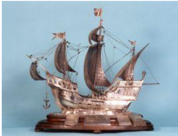
Original King of Spain Trophy

Boat Launching, Berthing & Storage: Competitors are invited to use the dry storage, hoists and assigned docks at CYC during the event, subject to applicable CYC guidelines and protocols. For information and arrangements regarding boat storage immediately preceding and following the event, contact the CYC Dockmaster.